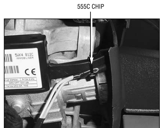
2000 Jeep Cherokee

NOTE: The example for capsule mounting location shown at the right is provided as a general reference only. Actual mounting locations for other vehicle makes and models may vary. Additional capsule mounting locations for specific vehicles can be found on DEI's technical website, www.directechs.com .